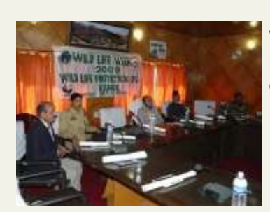
Meetings with the locals, teachers, students and villagers: to generate awareness

Workshop with the Administrators and District Officials: to deliberate on wildlife conservation issues