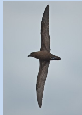
Fiji Petrel 2009, Photo: H. Shirihai