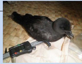
Fiji Petrel 2011